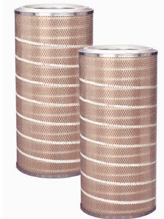
High Temperature Cartridge