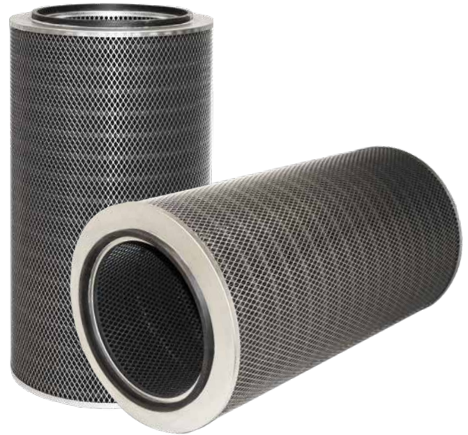
Ultra-Web Conductive FR Cartridge