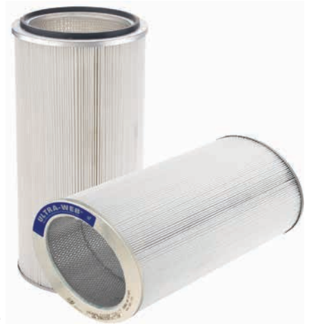
Ultra-Web SB Cartridge